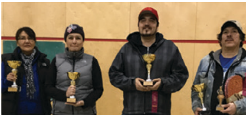
Right: Selkirk Curling Champions, place 1st in "A" Category at the Carmacks Annual Curling Bonspiel, February 2017.