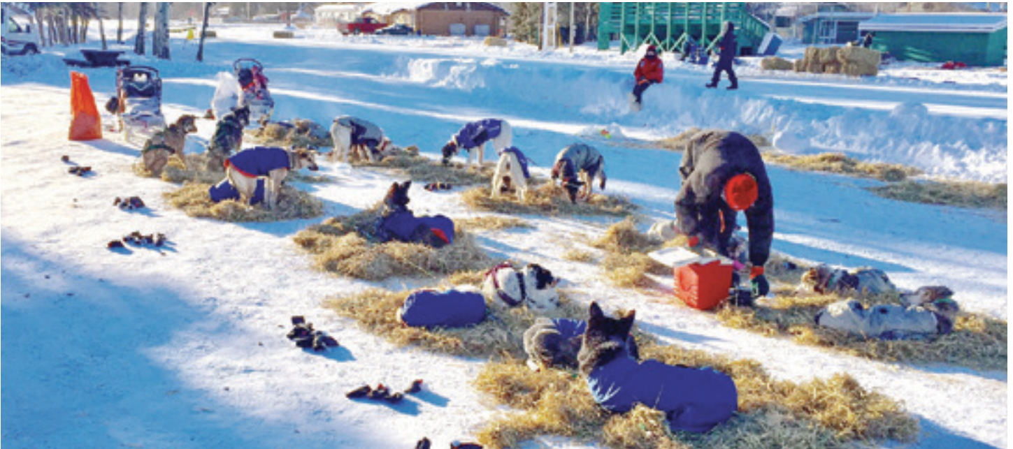
Above: A well deserved rest for the mushers and dog teams at the Pelly check point