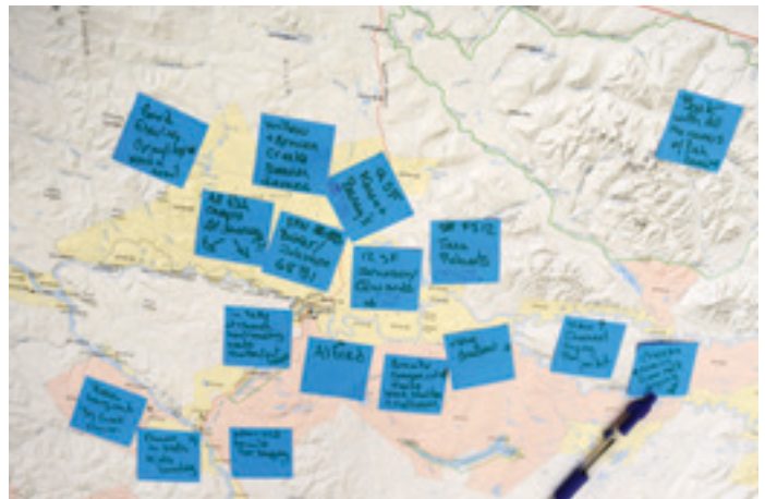
Below: Map of SFN Traditional Territory