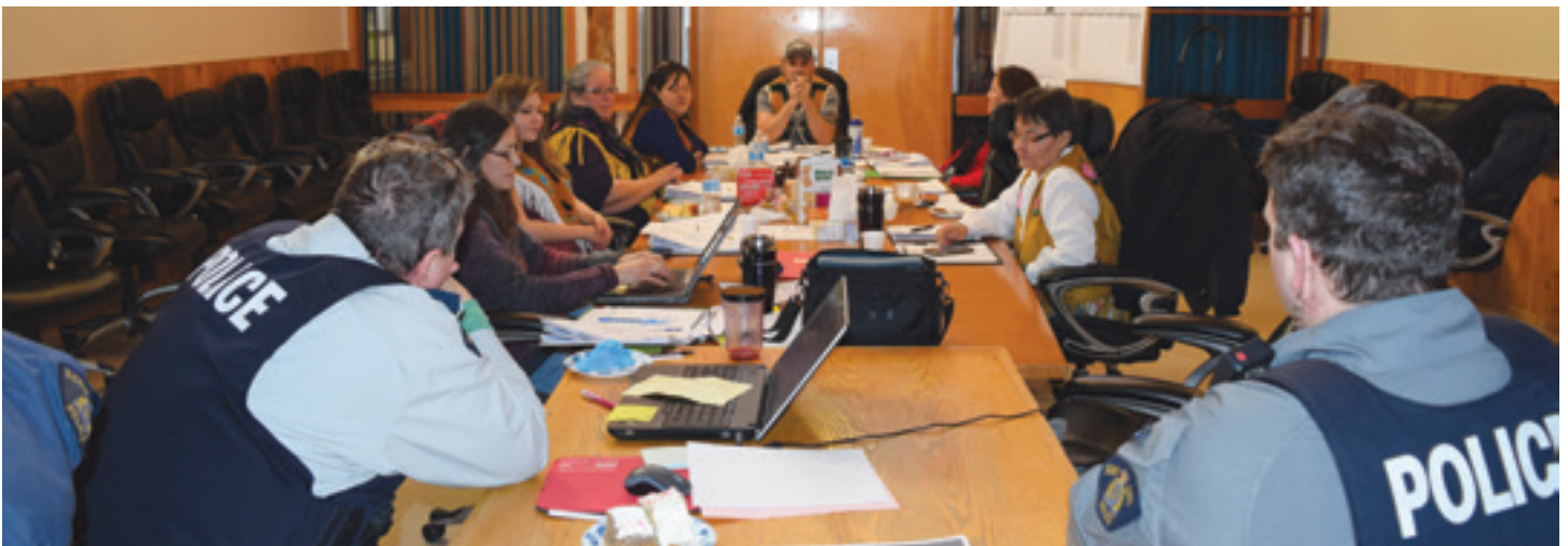
Above: Interagency update meeting

RCMP: The Council held a final interagency meeting with RCMP where a regular update was provided along with the Council giving their input into the RCMP Annual Performance Planning. The Council will continue with the priorities given the previous year (Vulnerable People, Relationship with the community and youth, Cultural Interaction / Awareness) with the addition of impaired driving. The RCMP will discuss their priorities with the new Council.