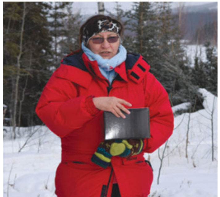
Left and Above: Staff recognition Long Service Award