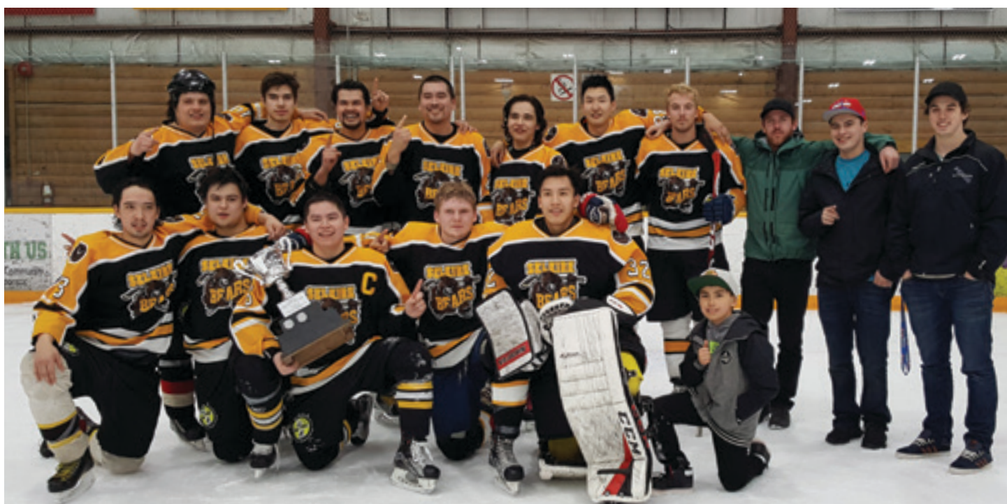
Above: Bringing home the Gold: Selkirk Bears win 1st place for "A" division at the Rendezvous Hockey Tournament, Whitehorse February 2017.