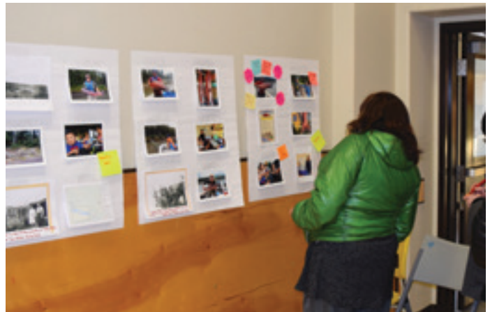
Above: Getting Citizens input at the open house