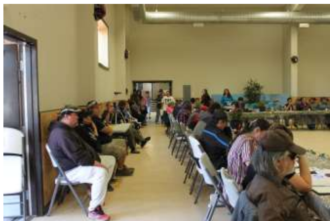
Northern Tutchone Participants