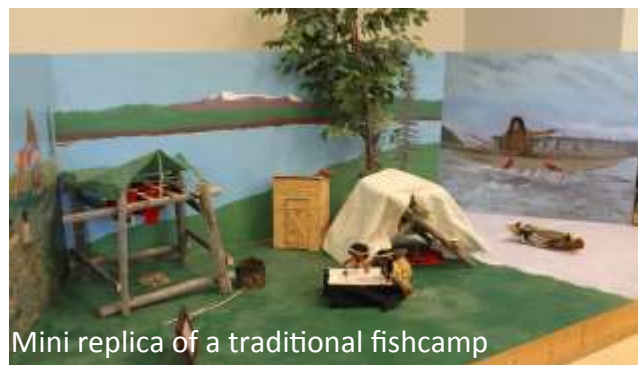
Mini replica of a traditional fishcamp