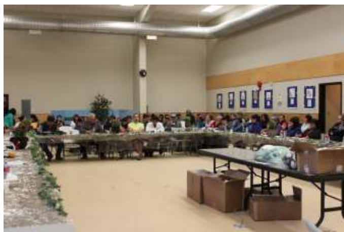
Northern Tutchone Participants