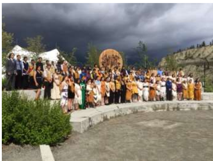
CYFN Native Graduation Ceremony. A historic moment for Yukon as the most grads at 139. SFN proudly held seven spots.