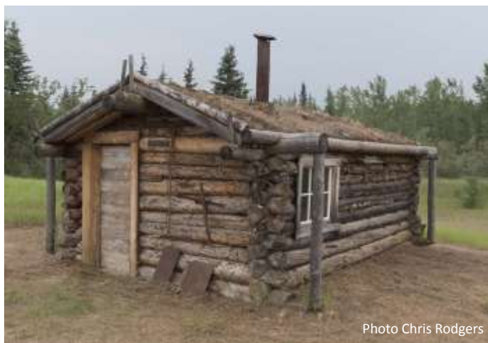
Late Elder, Tommy McGinty's cabin