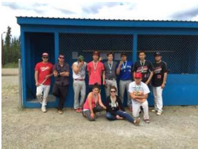
Mayo Ball tournament