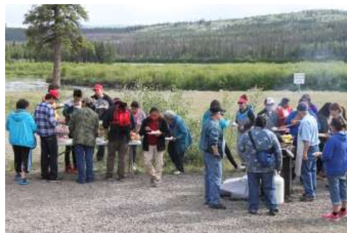
Selkirk Development Corporation hosted a barbecue at Minto Resorts June 10, 2015